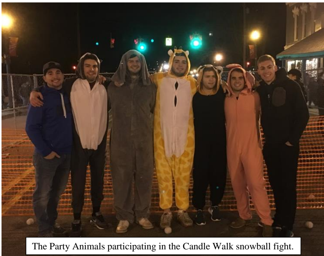
The Party Animals participating in the Candle Walk snowball fight.