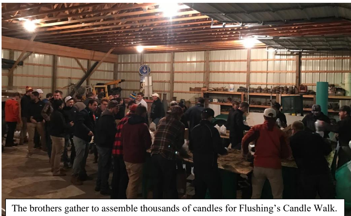
The brothers gather to assemble thousands of candles for Flushing's Candle Walk.