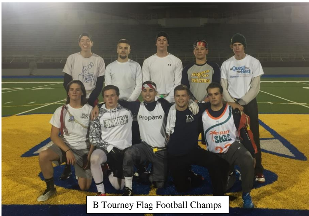
B Tourney Flag Football Champs