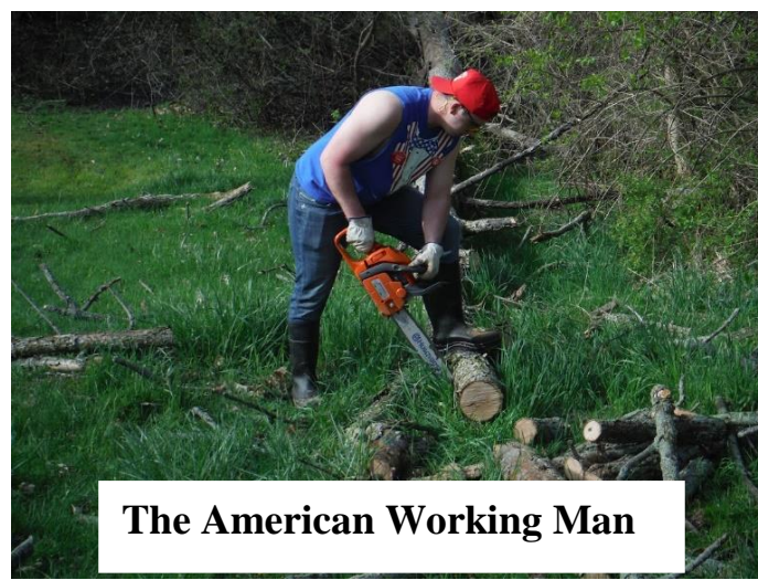
The American Working Man