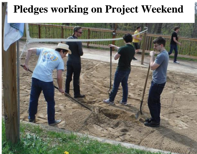
Pledges working on Project Weekend