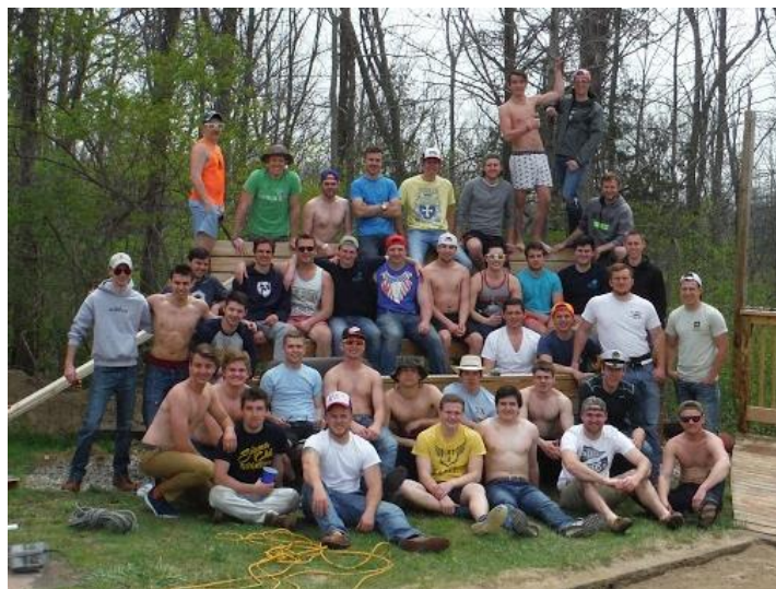
Sigma Chi Water Polo