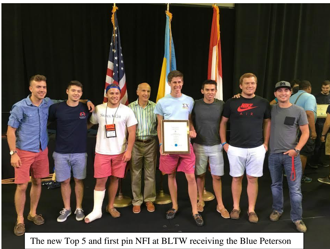
The new Top 5 and first pin NFI at BLTW receiving the Blue Peterson