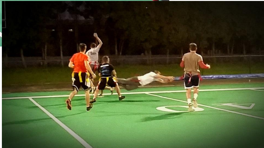
(Above and Right) With Kettering's recent purchase of Atwood Stadium, we used this facility to our benefit holding open pick up flag football games for all freshmen.