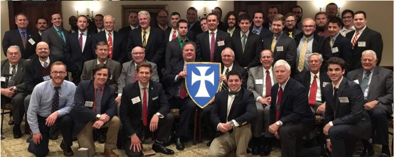
Above is a picture of the Detroit Alumni Chapters Annual Christmas Dinner. We had 9 undergrads attend and hope to have more involvement with DAC in the future. On the right is a picture of our annual Thanksgiving Feast complete with stuffing, mashed potatoes and gravy, and deep fried turkeys.