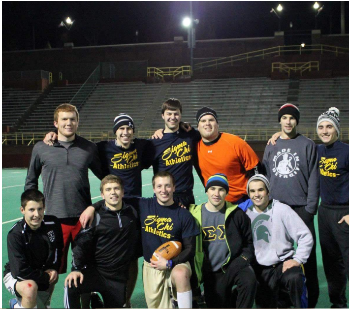
Pictured here is our R-Tourney Flag Football Championship team. The final game was Sigma Chi vs. Sigma Chi