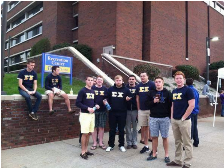
(Left) We eagerly started our successful recruitment term off waiting to move the freshman into their future homes in Thompson Hall.