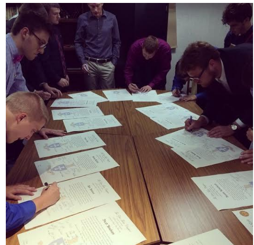
Brothers prepare Bids before distribution