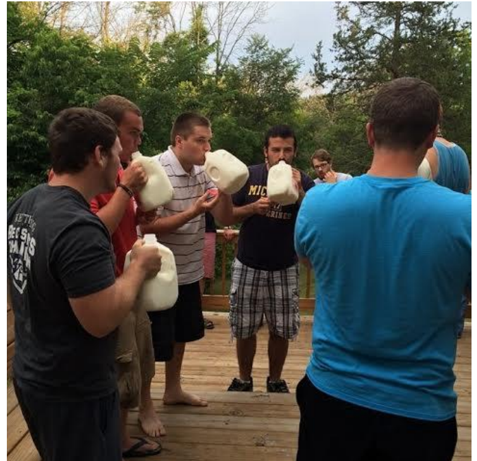
Brothers and potential new members participated in the Gallon Challenge during the Man Day of Excellence Recruitment event.