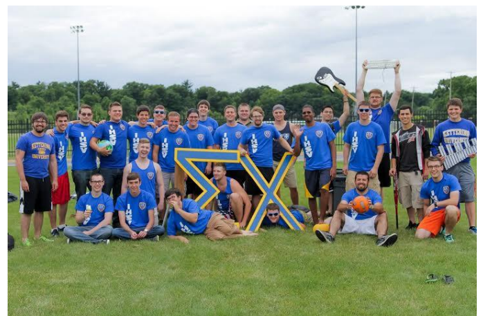
The group poses for a photo just before playing Runkleball!