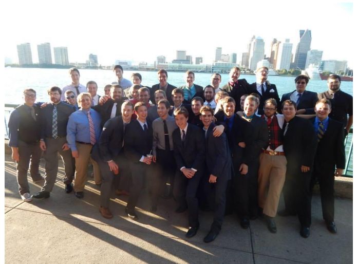
Brothers pose along the river before dinner