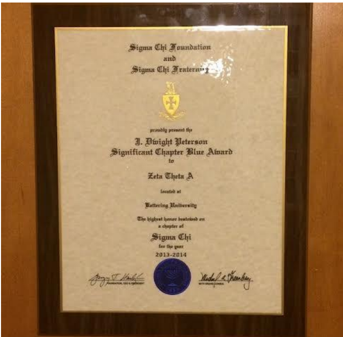
The 27 th Peterson hangs proudly in the Library!