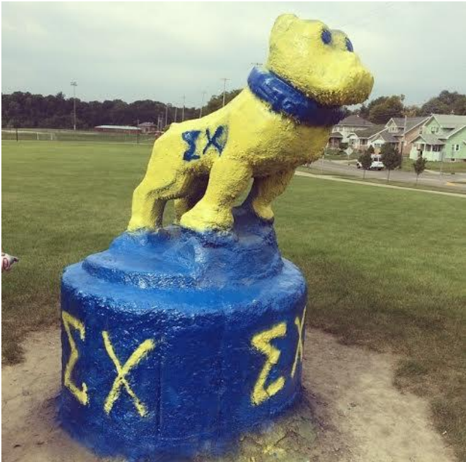
The bulldog painted in the only colors that make it look good!