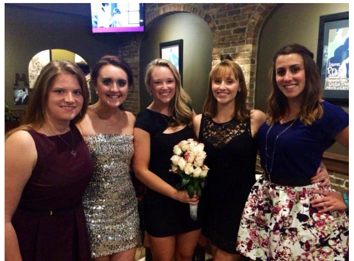
Our most recent Sweethearts