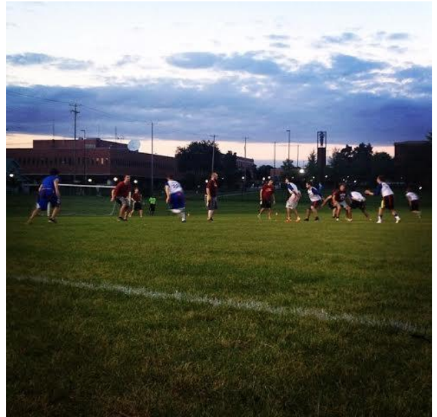
Brothers fight hard in flag football!

Sigma Chi had a solid showing this summer in intramural sports once again! We fought valiantly in everything from dodgeball to flag football, bringing home the bronze in softball! Showing Good Character, our boys fought hard and had a great time no matter what the result was. They would often come back to the House beaming from ear to ear, recounting the various plays they made and the individual battles they fought. Our teams, due to some very busy academic schedules and other Recruitment efforts, were made up of current Brothers as well as many of our Bid Recipients. The teams all worked well together in a fantastic display of true Brotherhood. As we all work to become better throughout the “offseason,” we are all greatly looking forward to the winter! We look to have some better results and bring home more hardware when we field teams for basketball, broomball, water polo, and volleyball in a few months!