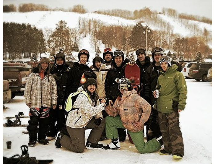
The group in the parking lot at Boyne!

Sadly, there was not as large of an alumni presence as many had hoped for. However, alumni are more than encouraged to attend our annual pilgrimage to Windsor, Ontario for Semi-Formal!