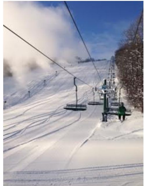
View from one of the chairlifts