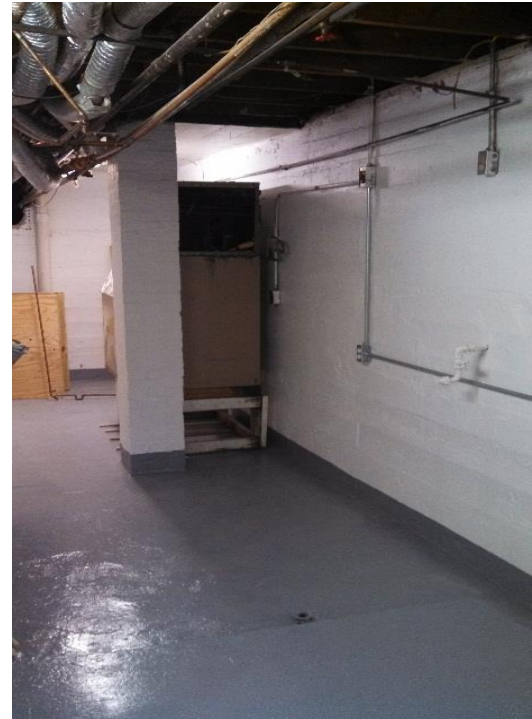
Concrete was cut for new fridges