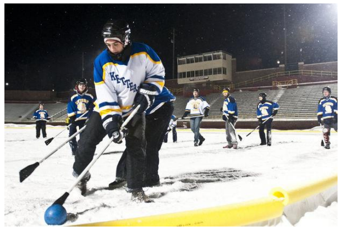
Sigs put the full court press on Lambda Chi Alpha