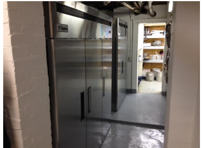
New fridges after installation