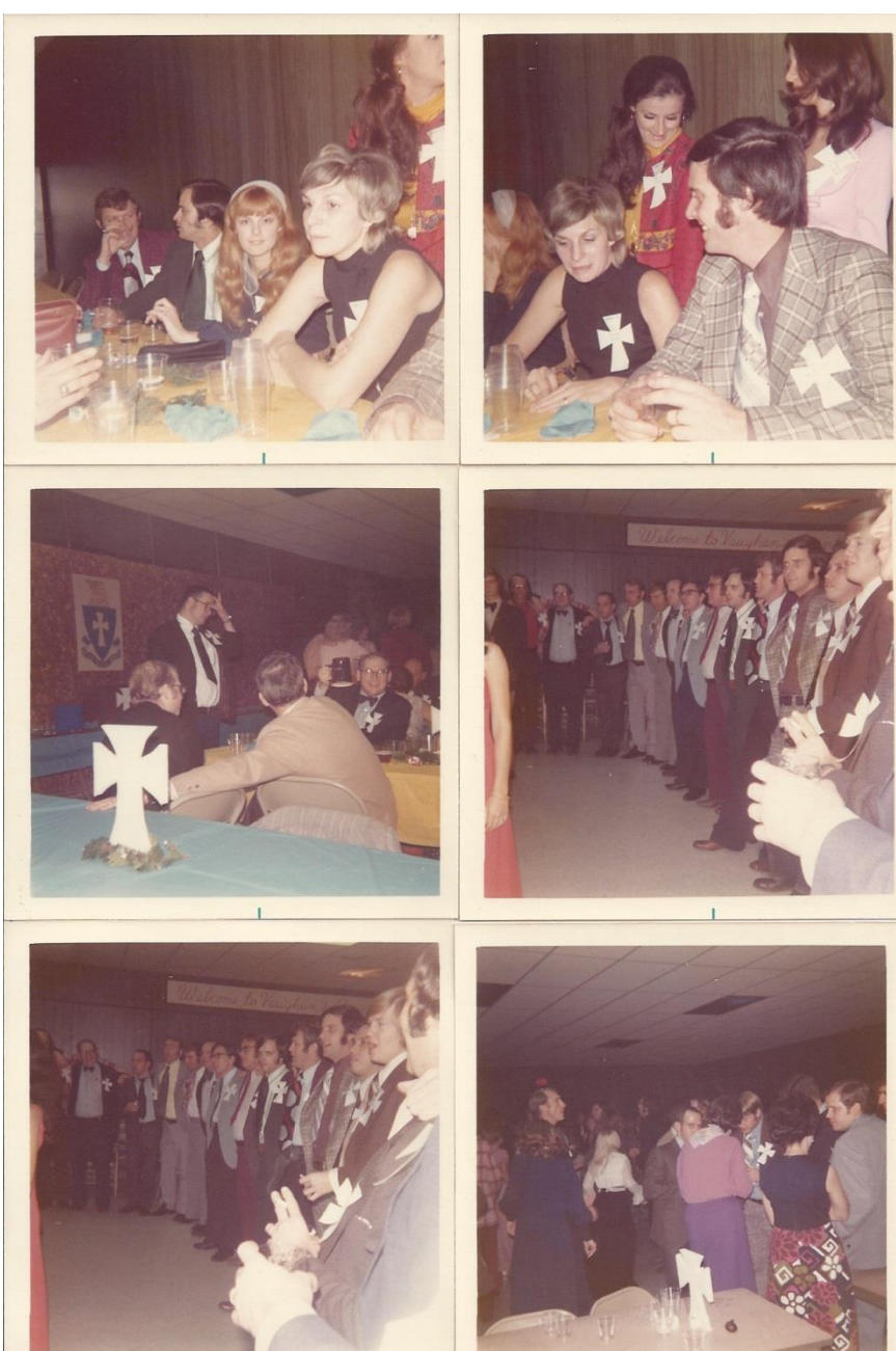
Above: Collage Submitted by an Alumnus Right: 50 th Anniversary Banquet Hall Below: White Roses from White Rose Ceremony at the 50 th Anniversary Banquet