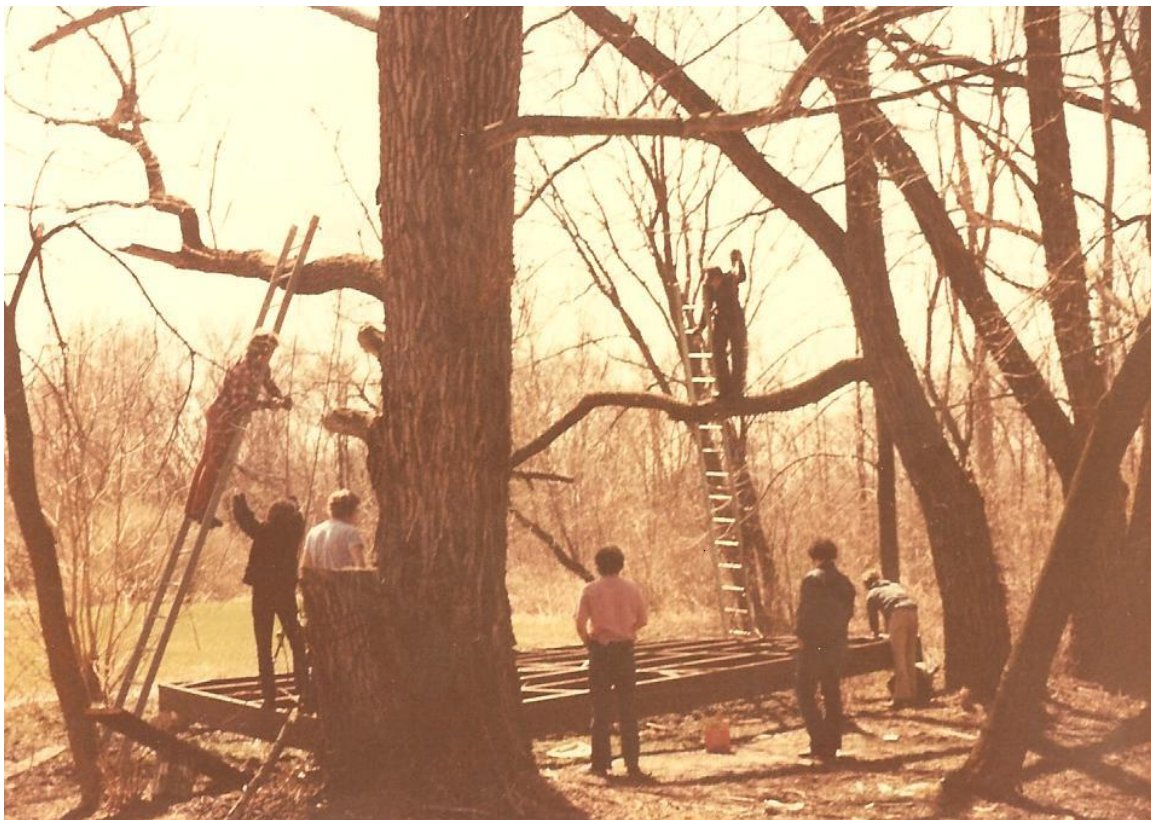
The Old Tree House