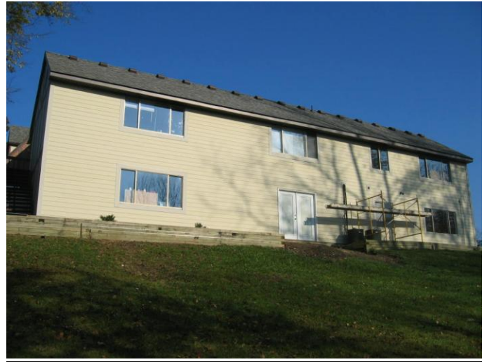
New Siding on the backside of the Addition.