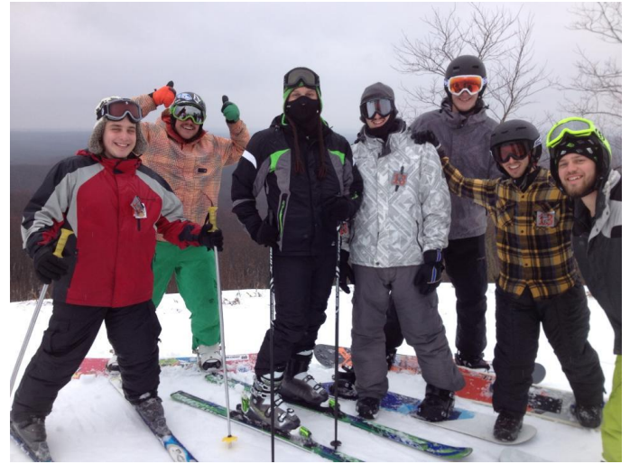
A group of Brothers atop the tawny peaks of Caber Fae!

Unfortunately we were not lucky enough to enjoy the company of any alumni, but strongly encourage you all to attend future ski trips and remember that our annual semi-formal in Windsor, Ontario will be during the month of August this year.