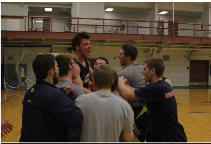
A group of Brothers celebrate an intramural victory!