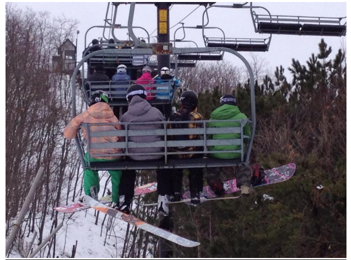
Taking the lift to the top.