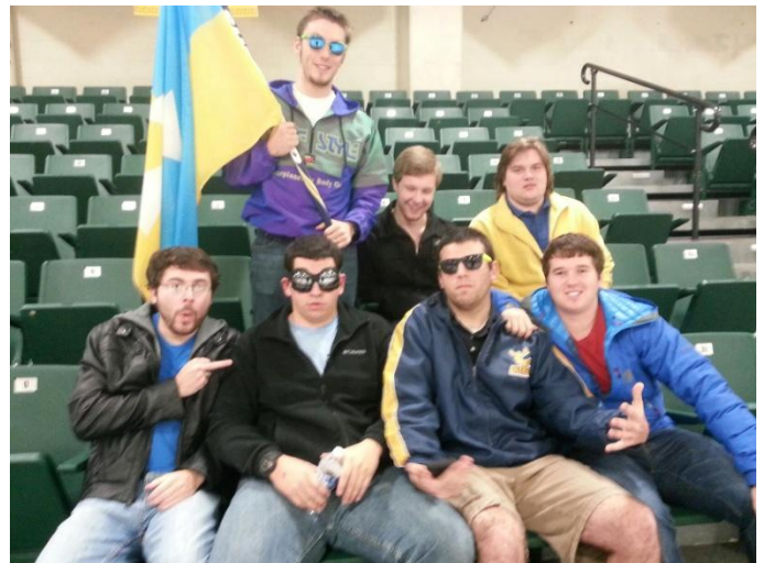
A group of Brothers gather to cheer on the KU Hockey team.